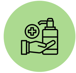
INCREASED HAND WASHING