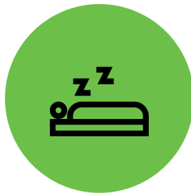
HEAD-TO-FOOT NAPTIME LAYOUT