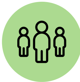
REDUCED GROUP SIZES PER AGE + CDC