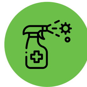
HEIGHTENED DISINFECTING OF ACTIVITES