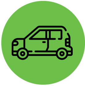
MODIFIED DROP-OFF & PICK-UP

for more information on policies and procedures at CTL Childcare Centers, earlylearning@transforminglives.org