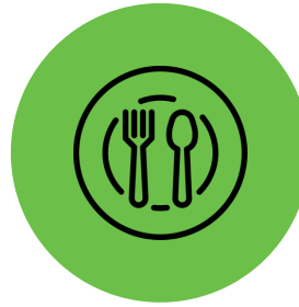
ALTERED FOOD SERVICE & OPERATIONS