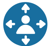
Economic Mobility Centers (coming soon)

CTL's Level Up , a small business development tool, coaches aspiring entrepreneurs in business literacy and micro-enterprise training, through one-on-one business mentoring and financial coaching, business labs, monthly workshops and business grants. Through small businesses, income is generated to improve a families' financial health.