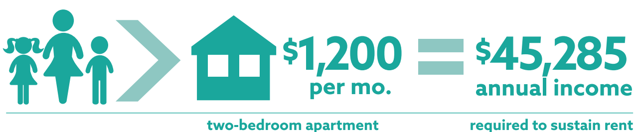
Data Source: U.S. Census Bureau American Community Survey 2017 Public Use Microdata Sample, as reported by the National Low Income Housing Coalition